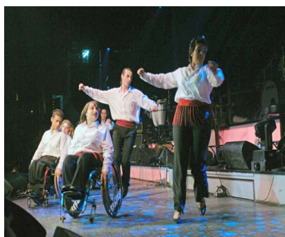
Wheelchair Dancing Event

The Institute of Entrepreneurship Development has undertaken the materialization of a local programme and action plan of networking in cooperation with KAPPA 2000 ( www.kappa2000.gr ), a non-profit organization that was founded in order to assist individuals with disabilities, particularly through the promotion and development of athletic and cultural activities.